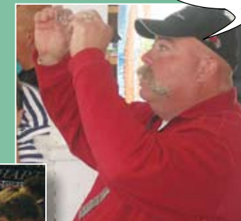
One of these days, I'm going to break down and get some lenses.