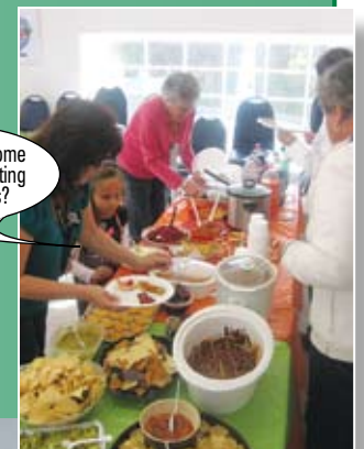
Mommy, how come we're always eating at these rallies?