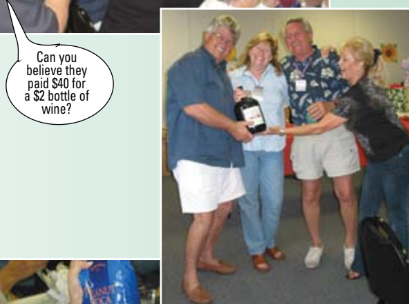
Can you believe they paid $40 for a $2 bottle of wine?