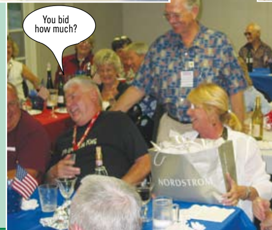
You bid how much?