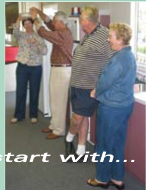
There were ten to start with...