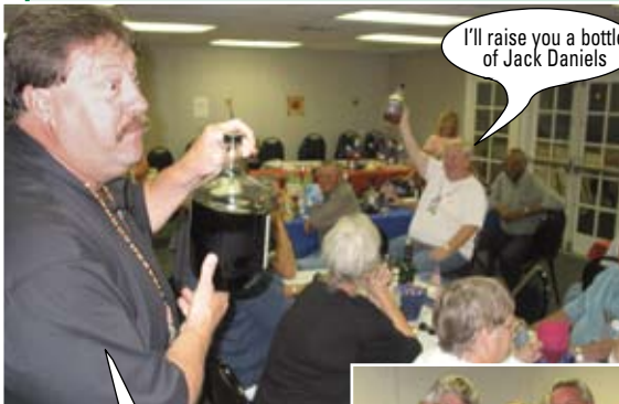
I'll raise you a bottle of Jack Daniels